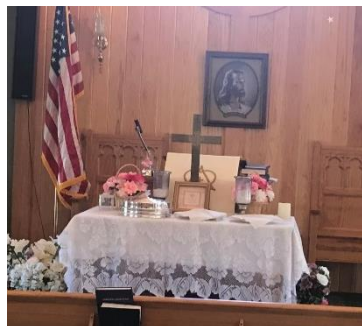
Bdecan Church Sanctuary